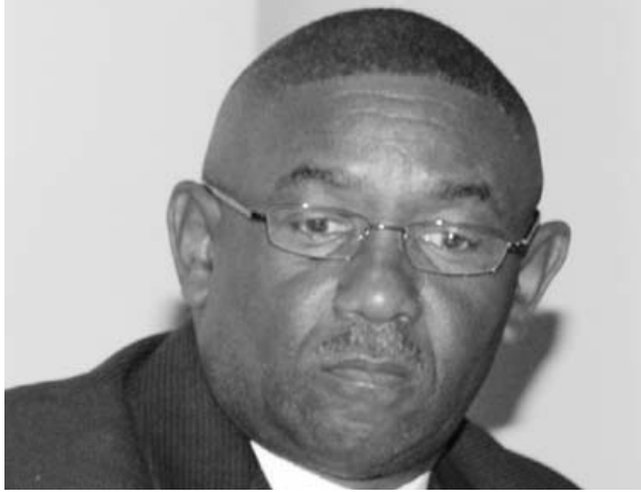
Charlotte-Mecklenburg, NC Chief Rodney Monroe

especially if you're not all under the same communications system, and not under a single command that's able to disseminate the information through the single communication system simultaneously.