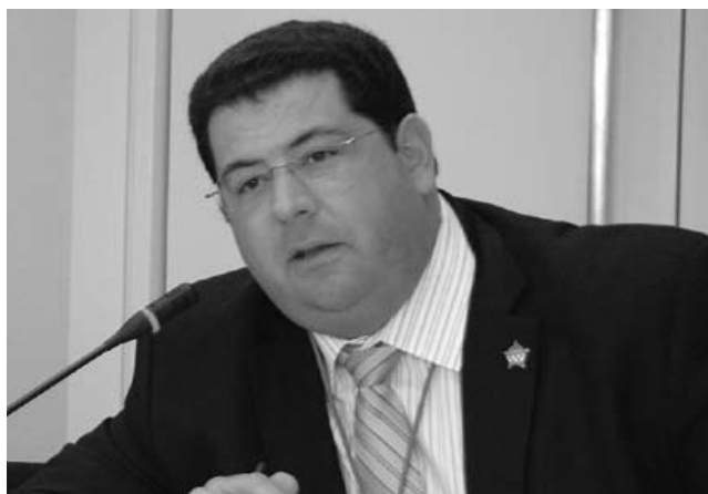
ABOVE: Rally celebrating the Chicago Blackhawks' Stanley Cup victory in 2009