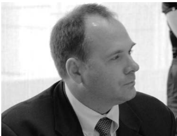
U.S. Capitol Police Chief Phillip Morse

For example, our original plan was that 1.8 million people would fit on the lawn of the National Mall, but the reality was that overflow blocked egress and access on streets around the Mall. So when you are executing a plan but it changes, who is going to get the information about those changes down to the officers in real time? It can be difficult,