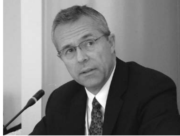
Toronto Police Superintendent Tom Russell

It's also important to consider how inflexible mobile field forces are. Once you're turtle suited up, you're not moving anywhere. It's impossible to move those guys a couple blocks away without a major production. But bike cops and officers in soft uniforms are incredibly flexible. They were able to corral the group very quickly. We made around 80 arrests, and every single one of those persons was convicted.