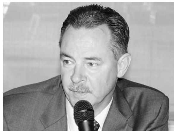
Former FEMA Director Dave Paulison

FEMA offers a course at our Emergency Management Institute in Emmitsburg, Maryland, called the Integrated Emergency Management Course. It is a four-day course to assess a city's specific emergency management needs and create a customized plan for that city. All the decision-makers from a city should be present, including the mayor, the police chief, fire, EMS personnel, and others who make decisions in a crisis. The course will take up to 70 people from a city. Oklahoma City went through the course right before the 1995 bombing. New Orleans went through it recently. It's a tremendous course.